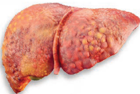
LIVER WITH TUMORS